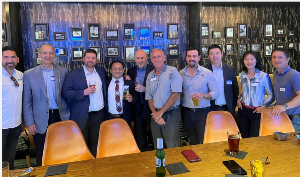
Golf networking event after the technology show. Thank Gaia for supporting the event.