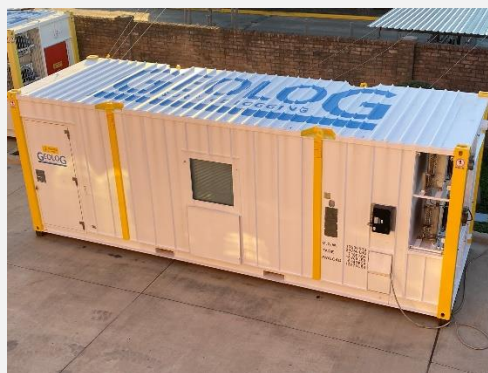
GEOLOG advanced offshore surface logging unit was exhibited on the show.