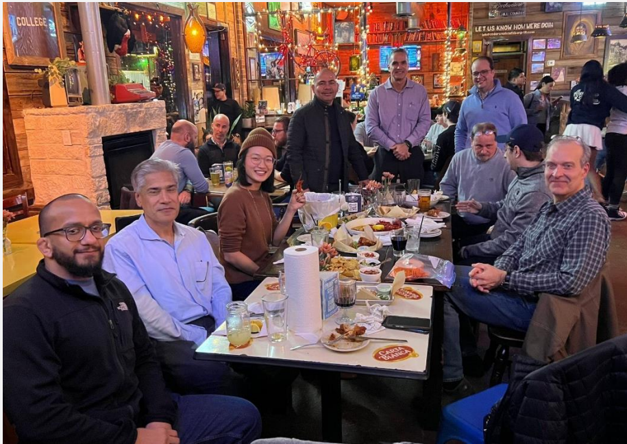
Houston chapter Networking time with guests. Happy to have current and past SPWLA international board members joining our event.