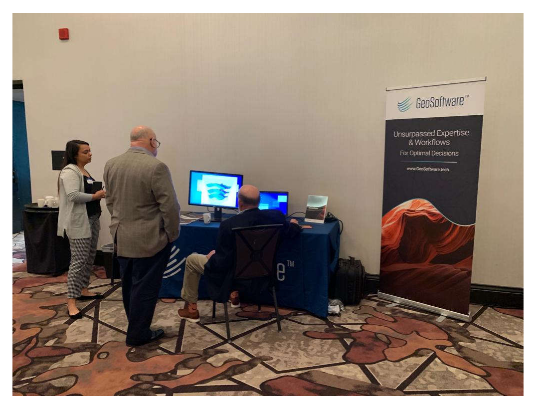
The Houston Chapter of SPWLA would like to thank GeoSoftware for sponsoring and supporting the event. Its presence was greatly appreciated by the petrophysics community.