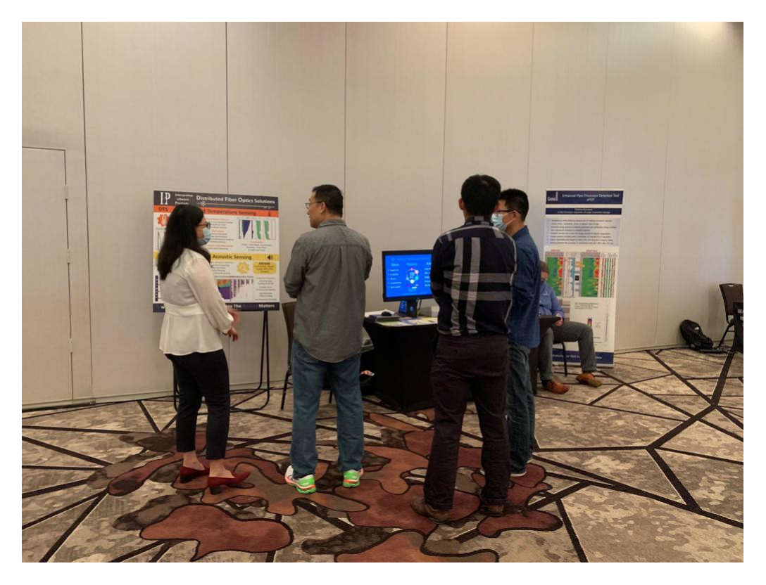
The Houston Chapter of SPWLA would like to thank ISP - Interpretive Software Products for sponsoring and supporting the event. Its presence was greatly appreciated by the petrophysics community.