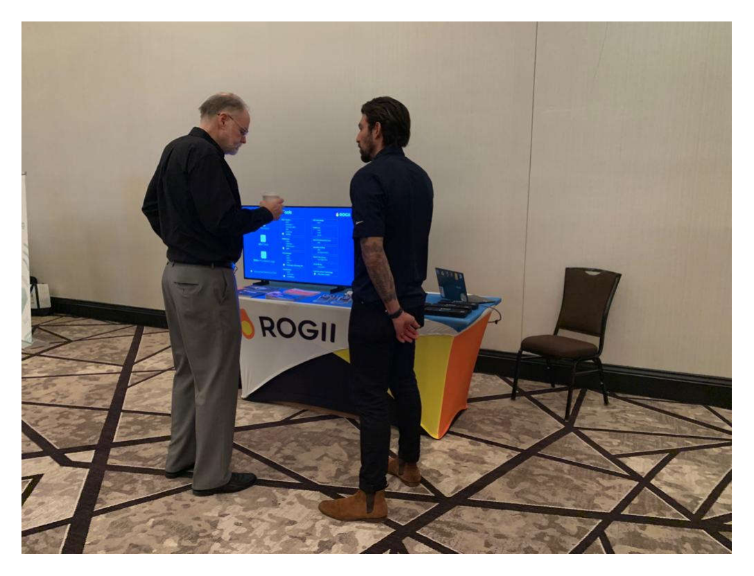
The Houston Chapter of SPWLA would like to thank ROGII for sponsoring and supporting the event. Its presence was greatly appreciated by the petrophysics community.