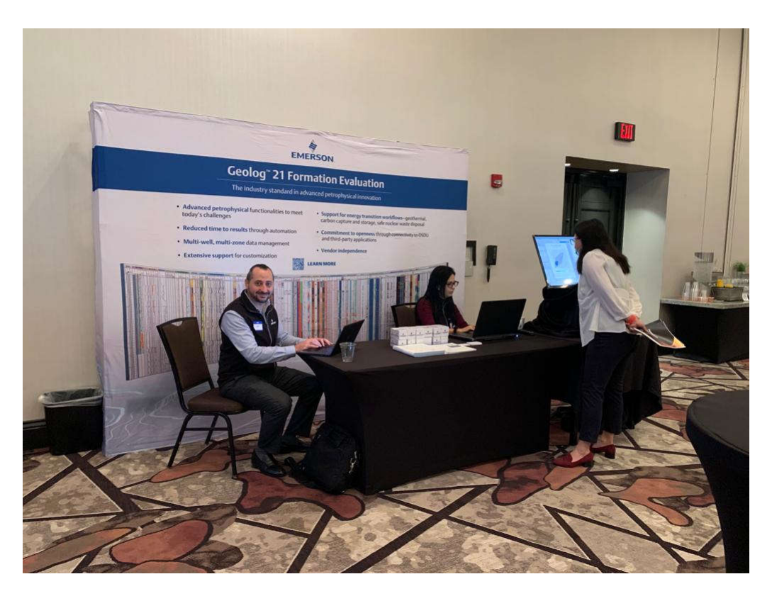
The Houston Chapter of SPWLA would like to thank Emerson for sponsoring and supporting the event. Its presence was greatly appreciated by the petrophysics community.