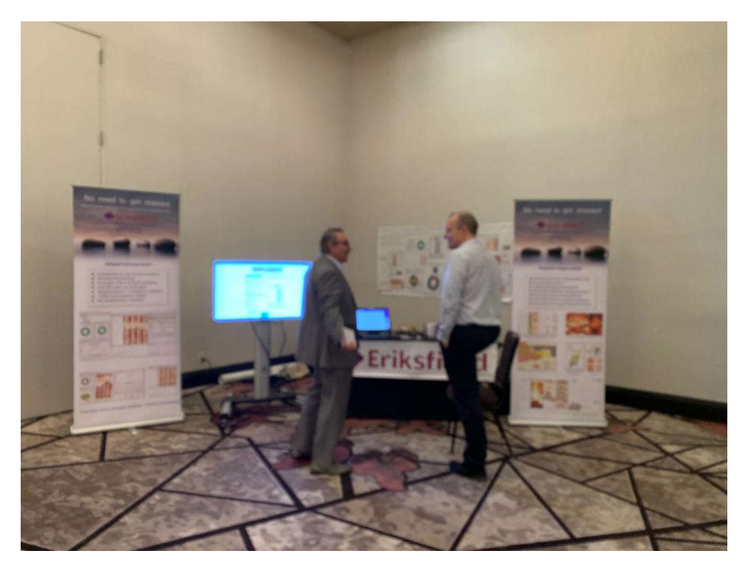
The Houston Chapter of SPWLA would like to thank Eriksfiord for sponsoring and supporting the event. Its presence was greatly appreciated by the petrophysics community.