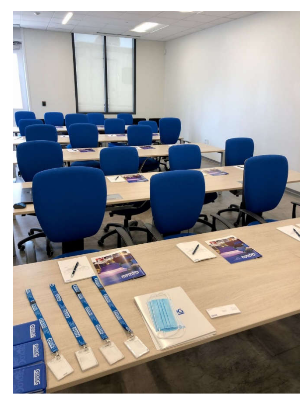
Geolog Americas offered a great location to host technical seminars and provided notebooks, pens, and technical journals to participants.