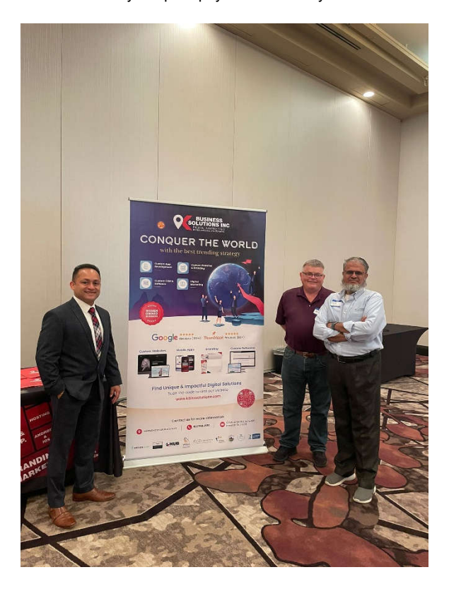
The Houston Chapter of SPWLA would like to thank K Business Solutions Inc for sponsoring and supporting the event. Its presence was greatly appreciated by the petrophysics community.