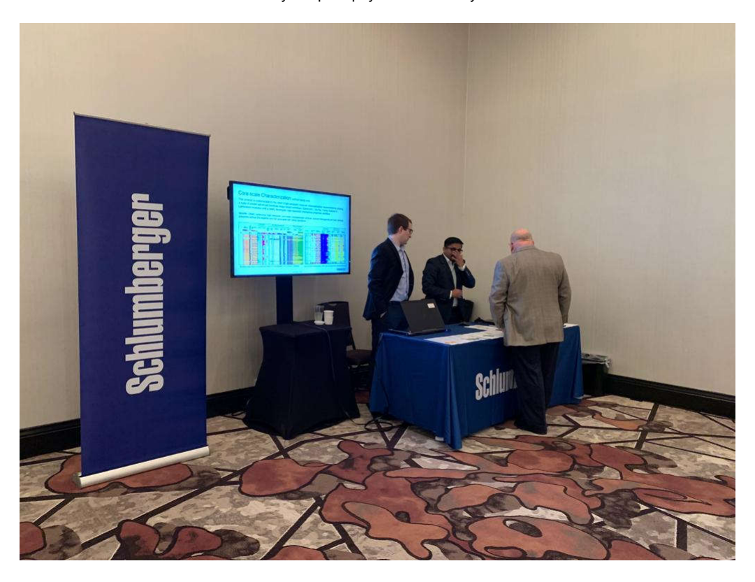
The Houston Chapter of SPWLA would like to thank Schlumberger for sponsoring and supporting the event. Its presence was greatly appreciated by the petrophysics community.