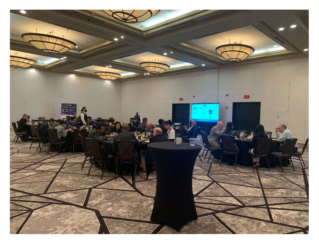
Attendees enjoyed a Texas 1836 lunch buffet prior to the SPWLA 2021 Distinguished speaker guest speaker lunch talk.