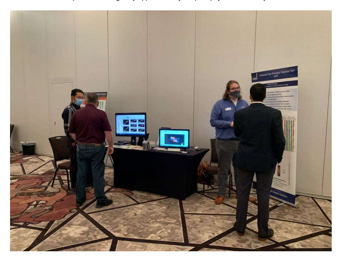
The Houston Chapter of SPWLA would like to thank GOWell for sponsoring and supporting the event. Its presence was greatly appreciated by the petrophysics community.