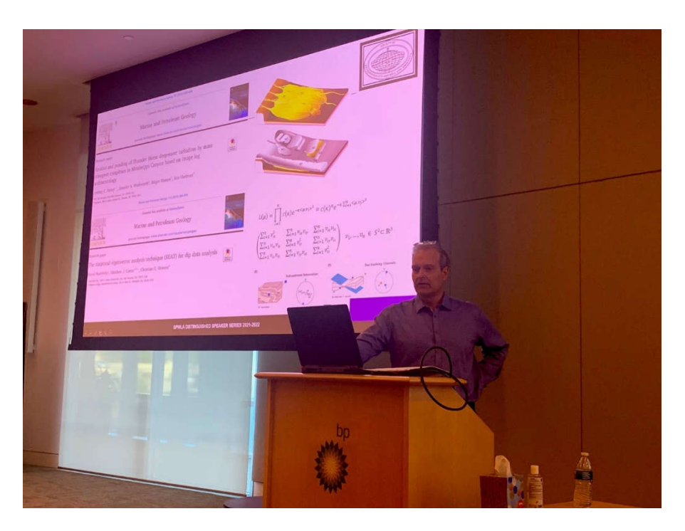
VP Westside of the Houston Chapter of SPWLA Bernd Ruehlicke explaining the beauty of statistical eigenvector analysis technique for dip data analysis.